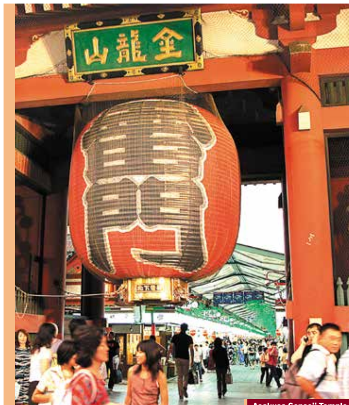
Asakusa Sensoji Temple